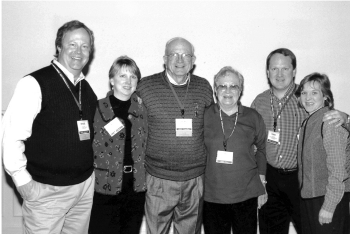
The Long Family